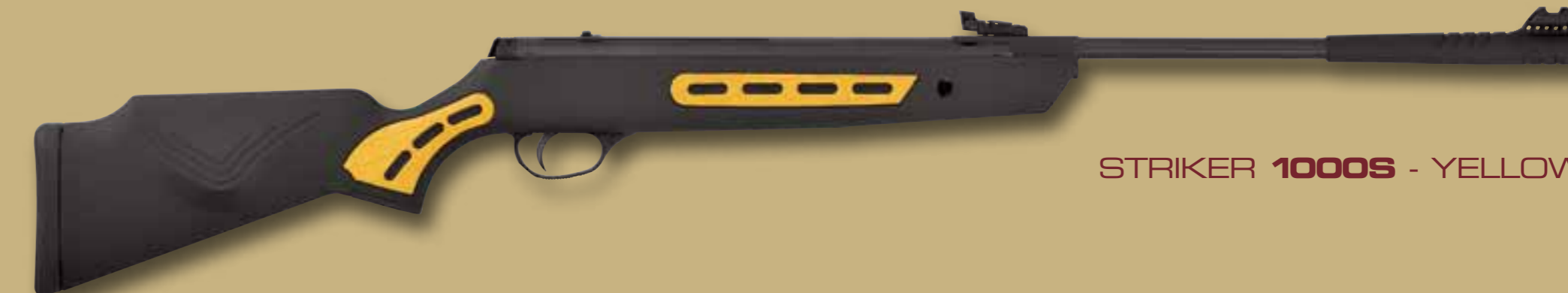
STRIKER 1000S - YELLOW

Soft rubber inlays are available in grey, dark grey, yellow and orange colors upon request