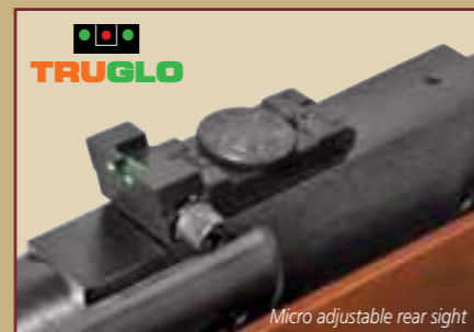
Micro adjustable rear sight