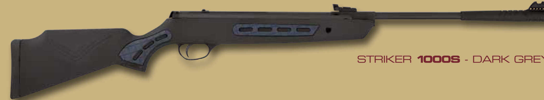
STRIKER 1000S - DARK GREY