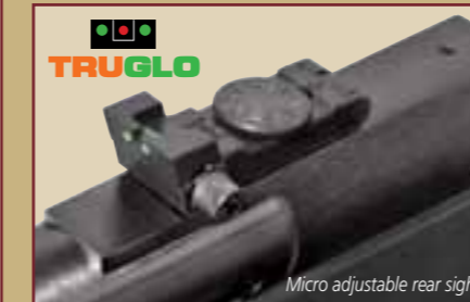
TRUGLO Micro adjustable rear sight