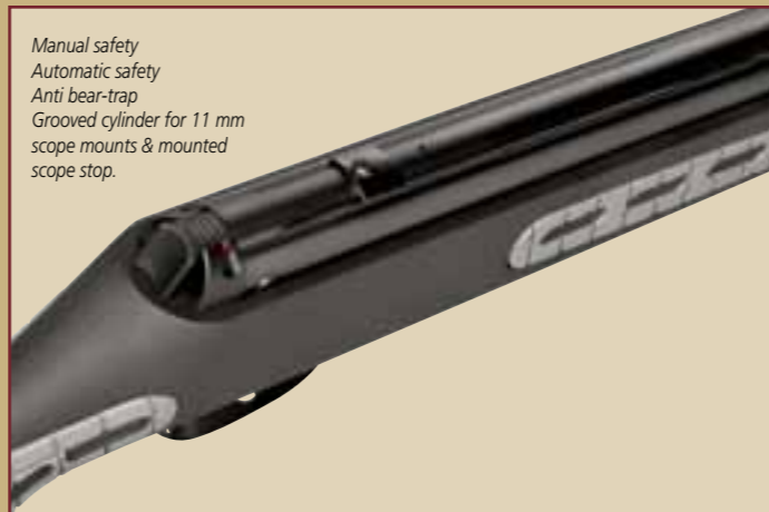
Manual safety Automatic safety Anti bear-trap Grooved cylinder for 11 mm scope mounts & mounted scope stop.