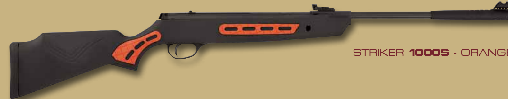
STRIKER 1000S - ORANGE