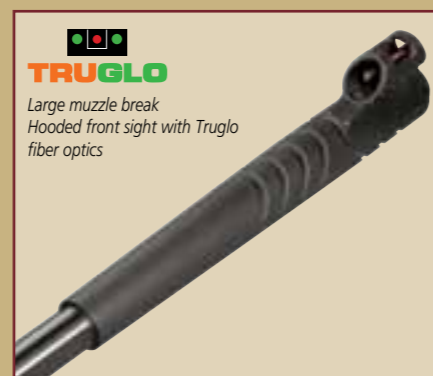
Large muzzle break Hooded front sight with Truglo fiber optics