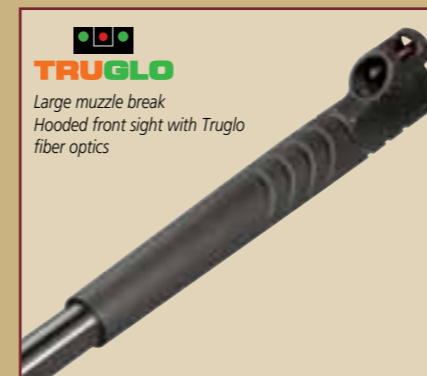
TRUGLO Large muzzle break Hooded front sight with Truglo fiber optics